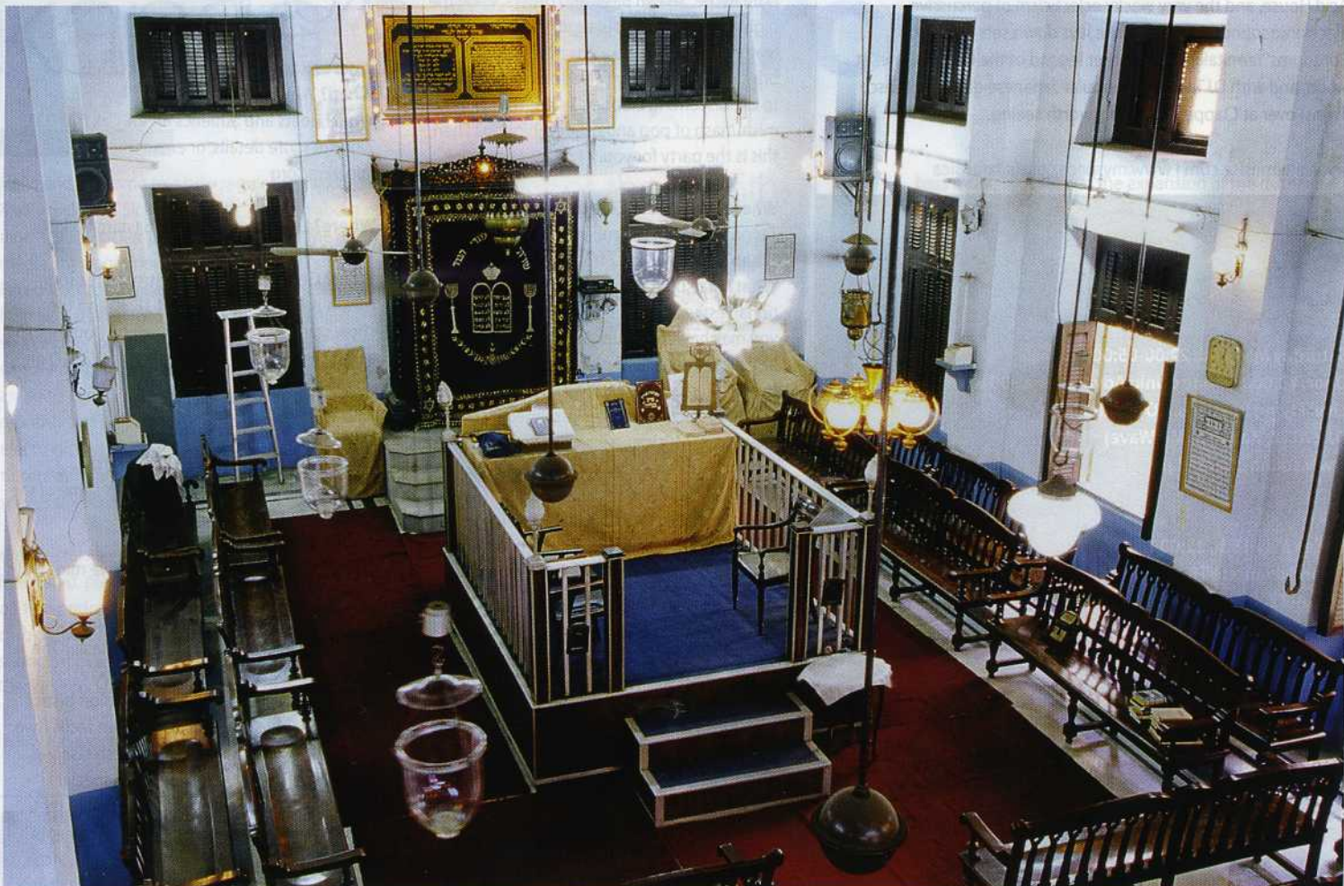
this is the oldest synagogue in mumbai, india (it was built in 1796), as seen through jono david's camera

jono david is running a unique business in osaka